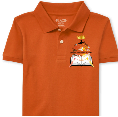
ORANGE S/S $20.00