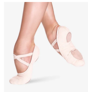
PINK CANVAS BALLET SHOE