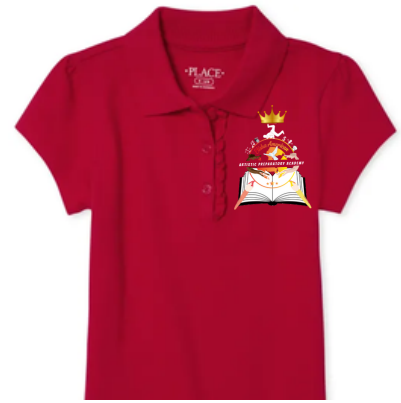
RED S/S $20.00