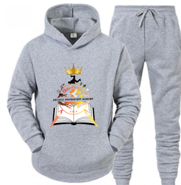
WARM UP SET