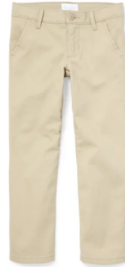
KHAKI PANTS No cargos or jeggings