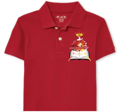
RED S/S $20.00

Scholar's may wear long sleeves in the respective colors during the winter months