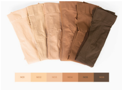
SKIN COLORED CONVERTIBLE TIGHTS