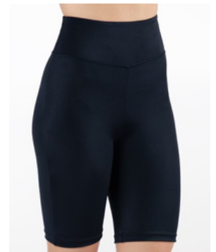
BLACK BIKER SHORT