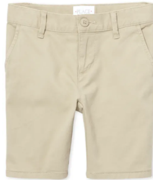
KHAKI SHORTS No Cargos, must be uniform material