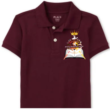
BURGUNDY S/S $20.00