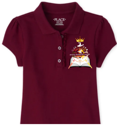
BURGUNDY S/S $20.00