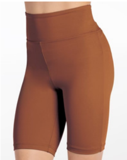
BROWN BIKER SHORT