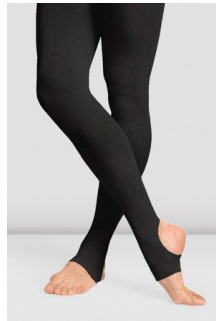
BLACK STIRRUP TIGHTS