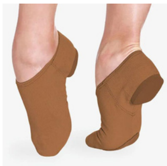
TAN CANVAS JAZZ SHOE