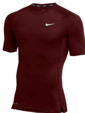
BURGUNDY S/S COMPRESSION SHIRT