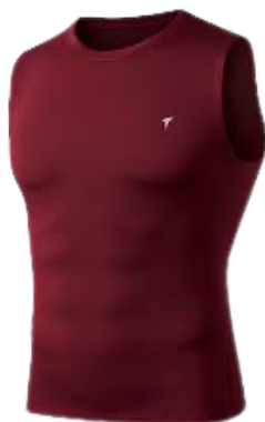
BURGUNDY SLEEVELESS COMPRESSION TANK