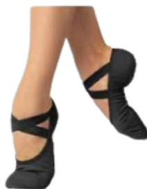
BLACK CANVAS BALLET SHOE