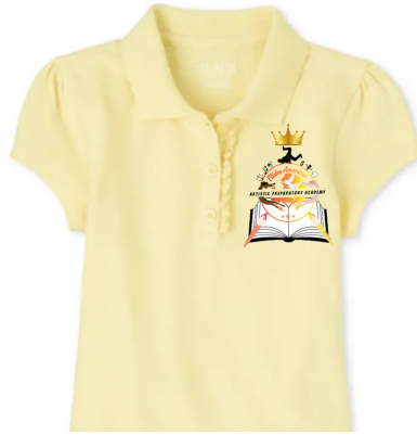
LIGHT YELLOW S/S