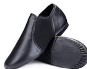
BLACK LEATHER JAZZ SHOE