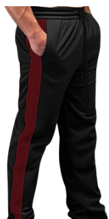
BURGUNDY/ BLACK ATHLETIC JOGGERS