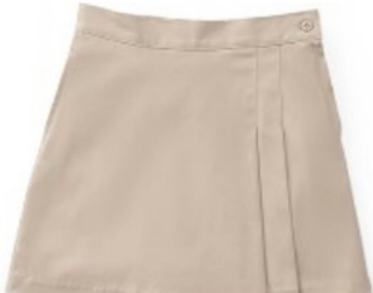
KHAKI STRETCH TAB DOUBLE PLEATED SCOOTER

Scholar's may wear long sleeves in the respective colors during the winter months