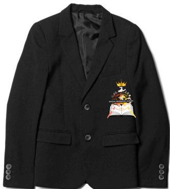
BLAZER $92 - $105