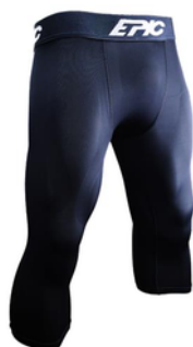
BLACK COMPRESSION TIGHTS