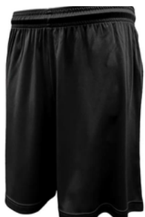
BLACK ATHLETIC SHORTS