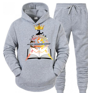
WARM UP SET