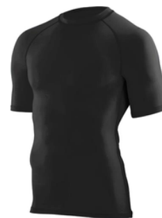
BLACK S/S COMPRESSION SHIRT