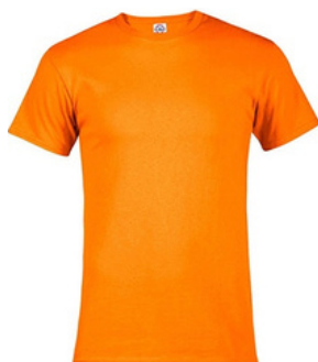
ORANGE S/S COMPRESSION SHIRT