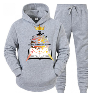
WARM UP SET