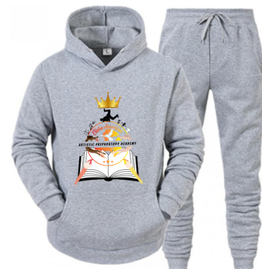
WARM UP SET