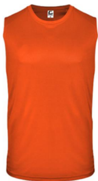
ORANGE SLEEVELESS COMPRESSION TANK