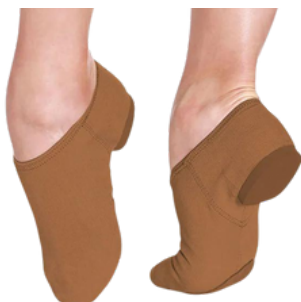
TAN CANVAS JAZZ SHOE