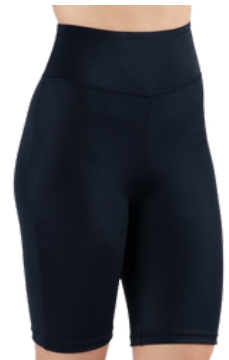
BLACK BIKER SHORT