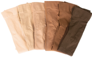
SKIN COLORED CONVERTIBLE TIGHTS