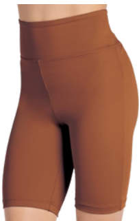
BROWN BIKER SHORT