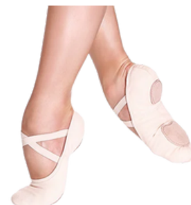
PINK CANVAS BALLET SHOE