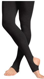
BLACK STIRRUP TIGHTS